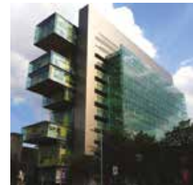
Civil Justice Courts, Manchester