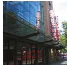
Sadlers Wells Theatre, London

Corporate Headquarters Civic Centres Major Universities High Specification Office Projects