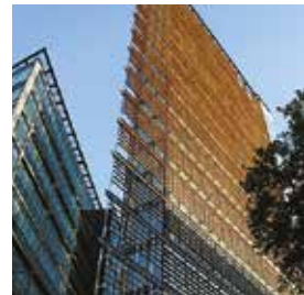
New Street Square, London