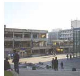
University of East Anglia

Shopping Malls Sports Stadia Railway Terminals International Airports