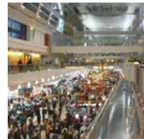
Dubai International Airport

Stainless steel is ideal for these harsh conditions, providing long life while retaining its aesthetics.