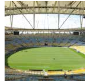
Maracanã Stadium, Rio de Janeiro